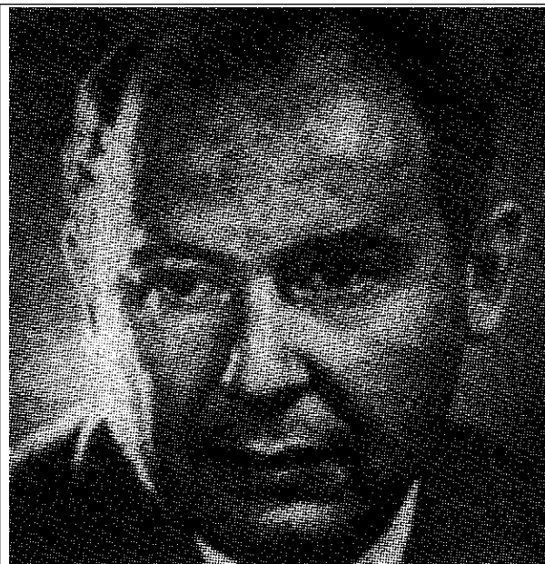
Dr. John Von Neumann, Professor at Princeton University in 1933, is believed to be the brains behind the theory of the project.

The most important piece of equipment on board the Eldridge was Tesla's "Zero Time Reference Generator", which he developed in the 1920s. This locked the ship and its inanimate components into the basic time reference of this space time continuum. However, human beings are not automatically "locked into" this zero time reference, but have their own time locks which are formed at conception, and end at death. The problem was to lock